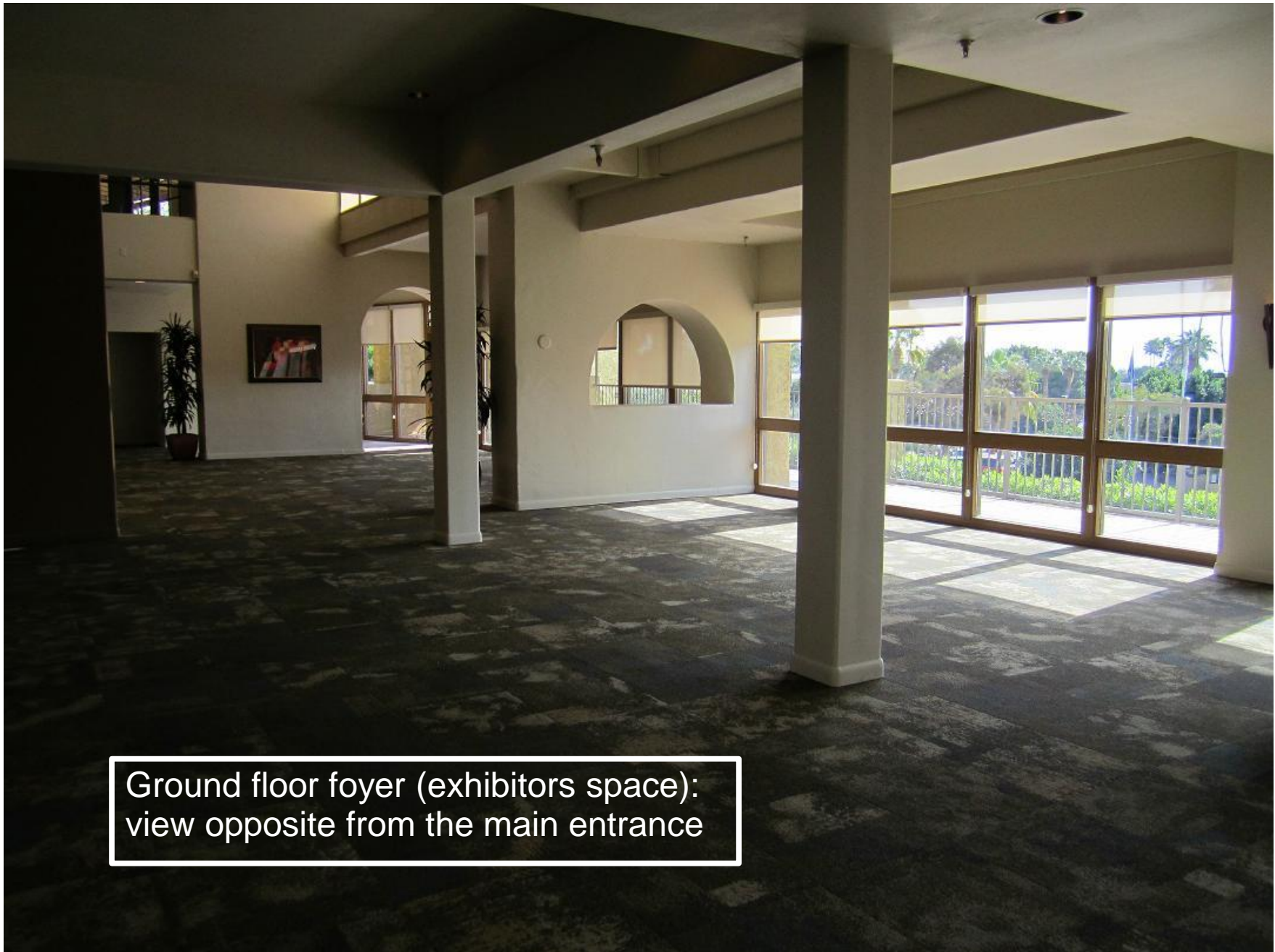
Ground floor foyer (exhibitors space): view opposite from the main entrance